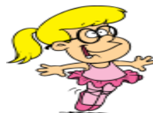
a happy girl

* Remember: Adjectives do not take -s in the plural.