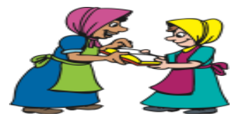
a two happy girls